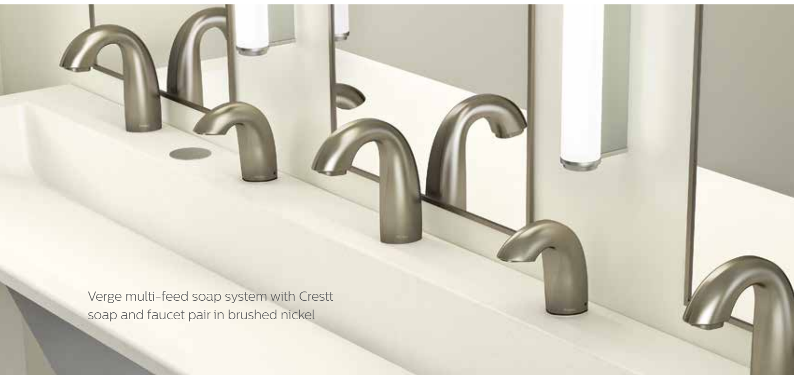
Verge multi-feed soap system with Crestt soap and faucet pair in brushed nickel